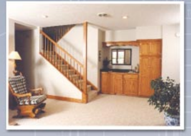
Turn your new modular home into a two story living space with room to grow as your family grows.

Today a complete, ready-to-build-on foundation is the most cost-effective way to ensure your new home will offer all the space you need. Today's comfortable, dry concrete foundations double the livable square footage of a single story home, or add 50% more space to a two-story home — all at a fraction of the cost of an upper level space. And with everything included in your foundation for one price, you can be assured you've made the right choice.